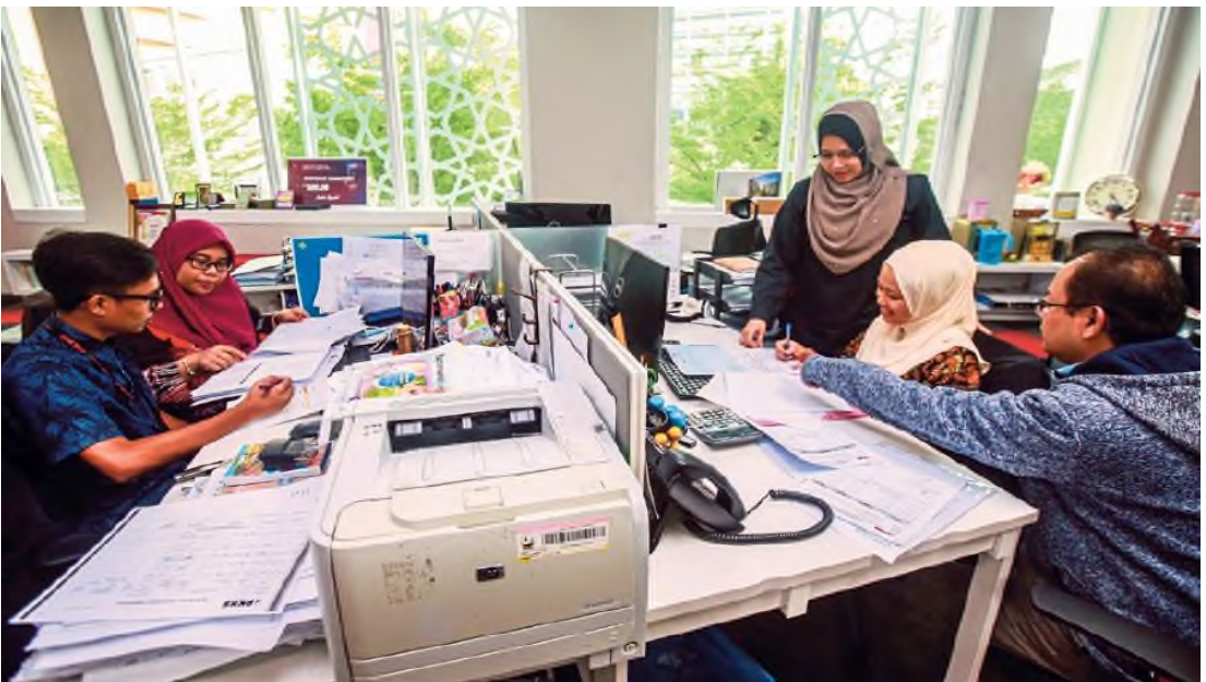
All offices are taking steps to follow the new norms.

"We cannot be constantly testing workers, too. There are around eight million workers and that's the figure for private sector alone.