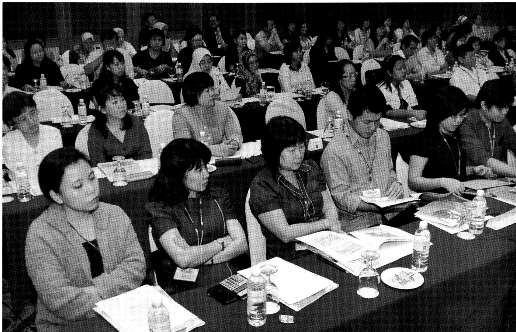
A section of the participants at the seminar yesterday.