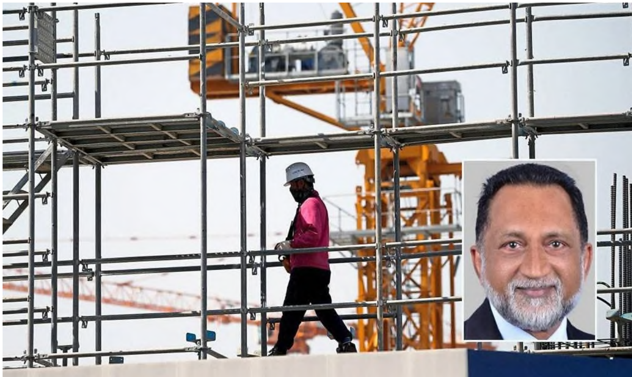
Photo for illustrative purposes. - File PIC (Smaller image, Hussain)

SHAH ALAM - The prevalence of employers replacing local workers with foreigners will cause long-term losses to the nation.